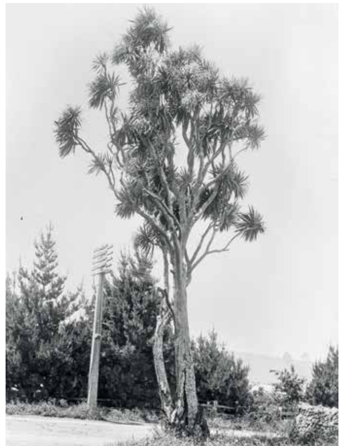
ABOVE: VIEW OF NEWMARKET SHOWING MANUKAU ROAD, NOW BROADWAY. HIGHWICK HOUSE TOP RIGHT. BELOW: THE CABBAGE TREE KNOWN AS TE TI TŪTAHI 1860'S.

Around 1851 this area received the name Newmarket because it was the site of the 'New Market' for livestock. Farmers would drive their stock up Manukau, Great South, or Remuera Roads to market which was better situated than the earlier stock market in Auckland proper. The presence of the a local railway station connecting it with Auckland, opened in 1873